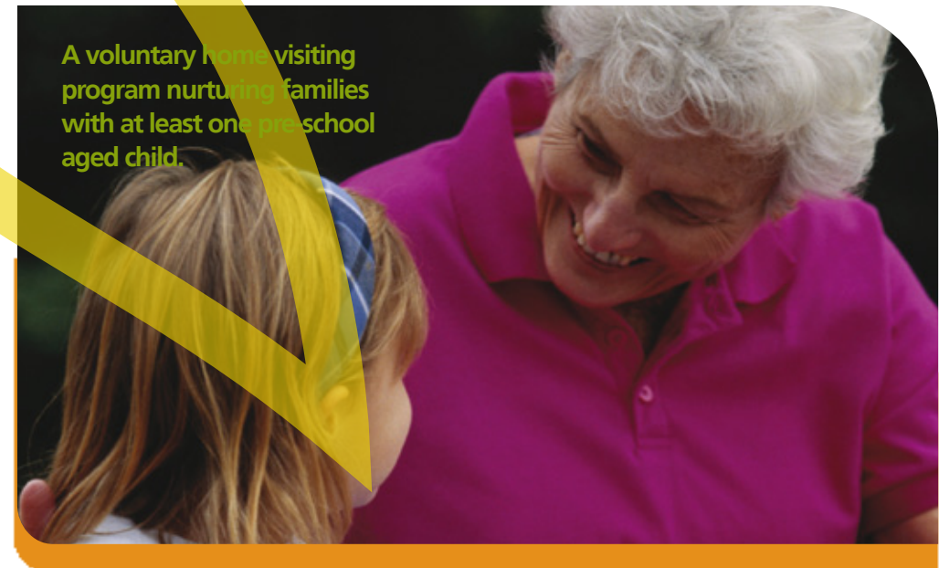
A voluntary home visiting program nurturing families with at least one preschool aged child.